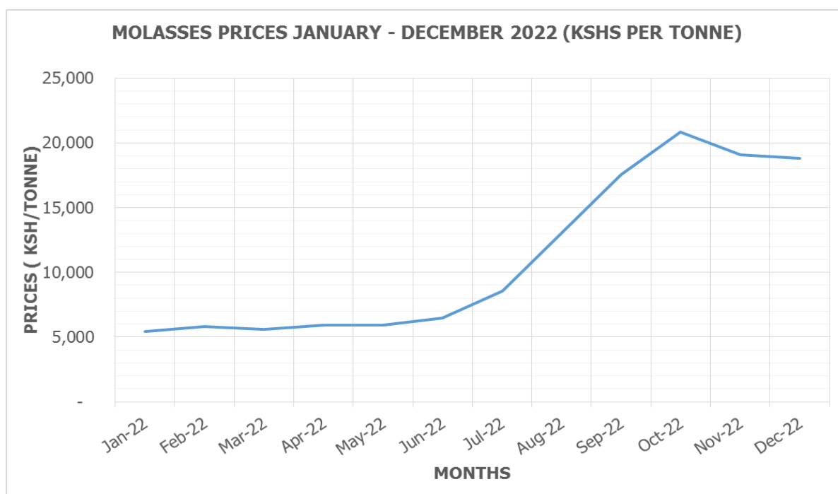
Figure 3: Molasses Prices January – December 2022 (KES per MT)

During the review period, molasses prices ranged between KES 4,508 - KES 24,223 per MT. The overall average molasses was KES 11,362 per MT, an increase from KES 4,535 per MT recorded in 2021. For more details, refer to Figure 3.